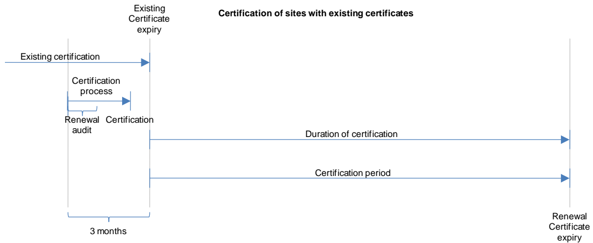
Figure 1 - Certification of Sites With Existing Certificates